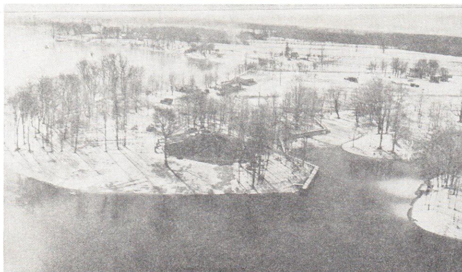
Aerial view of Main Beach and Clubhouse.

All roads at Roaming Rock Shores constructed on or before December 15, 1966 will be paved as soon as weather conditions permit, according to Ray Melton, Project Manager. "All these roads will have to be reworked and, in a few cases, additional base material applied before paving can begin" Melton said. "We hope to have the work completed by the last of July; weather is the big factor," he concluded. Roaming Rock Shores is the only project of its kind that paves all the roads to every lot on the development.