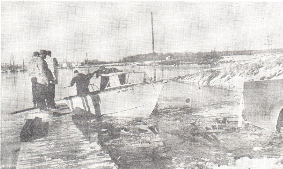
First boat launched on frozen lake.